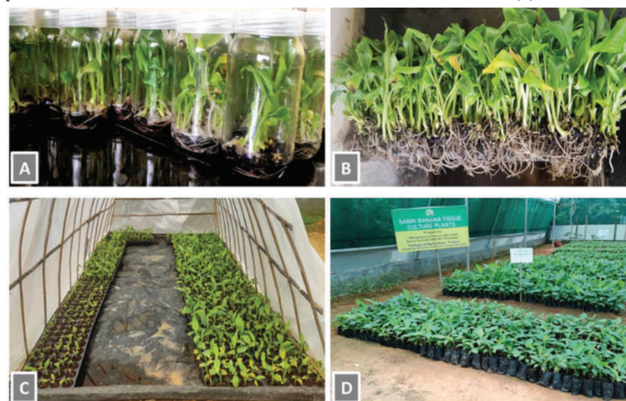
Fig. 1. Images depicting Bio-immunized sabri banana plantlets: A. Tissue culture-raised bio-immunized sabri plantlets inside culture bottles; B. Bio-immunized sabri plantlets with profused shoots and roots at ICAR-Central Institute for Subtropical Horticulture, Lucknow. C. Primary hardening of bio-immunized plantlets at the College of Agriculture, Tripura; D. Secondary hardened sabri plants used for distribution to farmers of Tripura.

This investigation was carried out at Lembucherra, Jirania region of West Tripura district. The plants were planted in the first week of June, 2022-23 & 2023-24 and all the scientific package and practices of banana cultivation were followed.