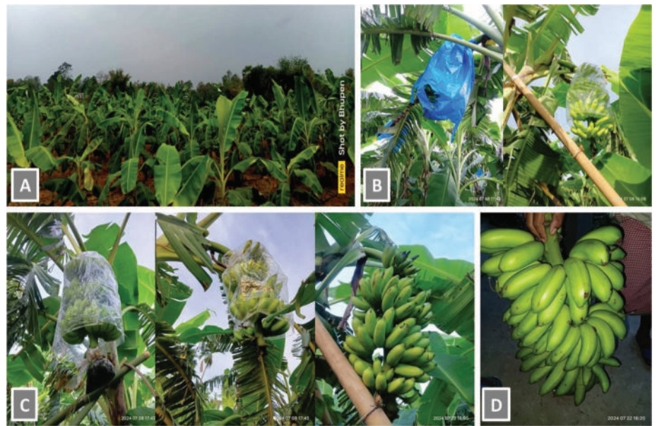
Fig. 2. Successful cultivation of bio-immunized banana plants of cv. Sabri in Tripura. This figure shows a banana plantation located in Tripura, India A. The images show aerial view of healthy bio-immunized plants; B & C. The image depicts banana plant bearing large bunch of bananas, with some plants visibly protective blue netting or polythene cover around the fruit bunches, used to prevent damage from pests and environmental factors. D. Fresh harvested fruits from the bio-immunized banana plants.

Earlier, study revealed that use of consortium of Pseudomonas aeruginosa DRB1 and Trichoderma harzianum CBF2 against FOC Tropical Race 4 (FOC-TR4) reduced the disease incidence percentage significantly (Wong et al. , 2019). Combined application of fungicide with Pseudomonas floescence strain PF1 showed reduction of disease incidence up to 64 % in the green house and 75 % in field conditions against FOC Race-1 (Akila et al. , 2011). Further, Shen et al. , (2015) has documented that application of bio-fertilizer “BIO” reduced disease incidence to 20 % compared to 38 % in control in China. Based on our results and the earlier reports, it can be observed that use of bio-immunized plantlets along with the periodical application of the ICAR-FUSICONT showed significant reduction of the disease in the adopters fields (Damodaran et al. , 2019; 2020; 2023; Rav et al. , 2025). Combination of carbendazim, sodium silicate, and Bacillus subtilis significantly reduced the incidence and severity of Fusarium wilt in banana plants, which resulted in improved plant growth and yield (Zakaria et al. , 2023). Integrated application of Bacillus velezensis EB1 and Potassium sorbate reduce the Fusarium wilt